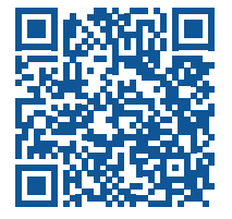
Plow Progress Map

THIS IS NOT A LEGAL DOCUMENT: The information shown on this map is compiled from various sources and is subject to constant revision. Information shown on this map should not be used to determine the location of facilities in relationship to property lines, section lines, streets, etc.