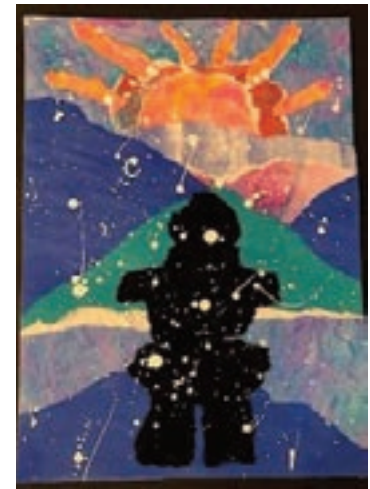
Explore colorful landscapes in the style of British-Canadian artist Ted Harrison.