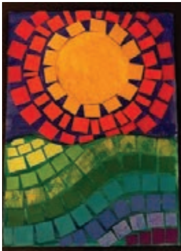
A project inspired by Alma Thomas, 20th century American expressionist.

Call us at 509-625-6677 for more information.