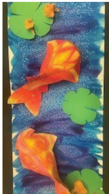
Nishikigoi, known as Japanese Koi, are raised for their colorful patches.