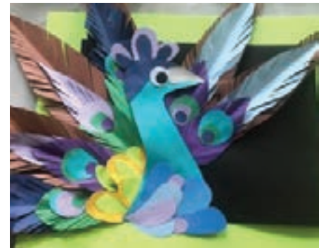
Peacocks have been a symbol of wealth, beauty and rebirth since ancient times.