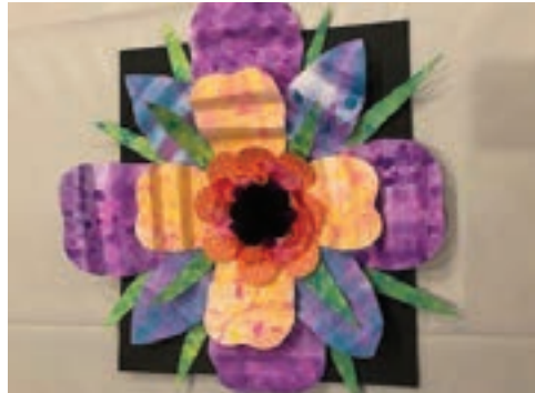
Georgia O'Keeffe, mother of American modernism, inspired this art project.