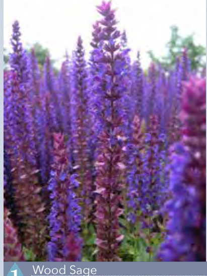
Salvia nemerosa 'Ostfriesland'

This colorful combination was designed and installed by Garden Landscapes to provide a variation of color and textures throughout the seasons.