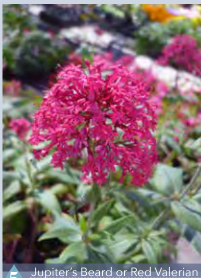
5 Jupiter's Beard or Red Valeriar Centranthus ruber 'Coccineus'