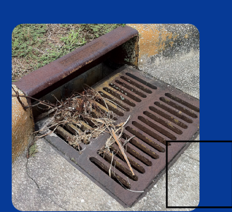
Storm Drain with leaves or sticks