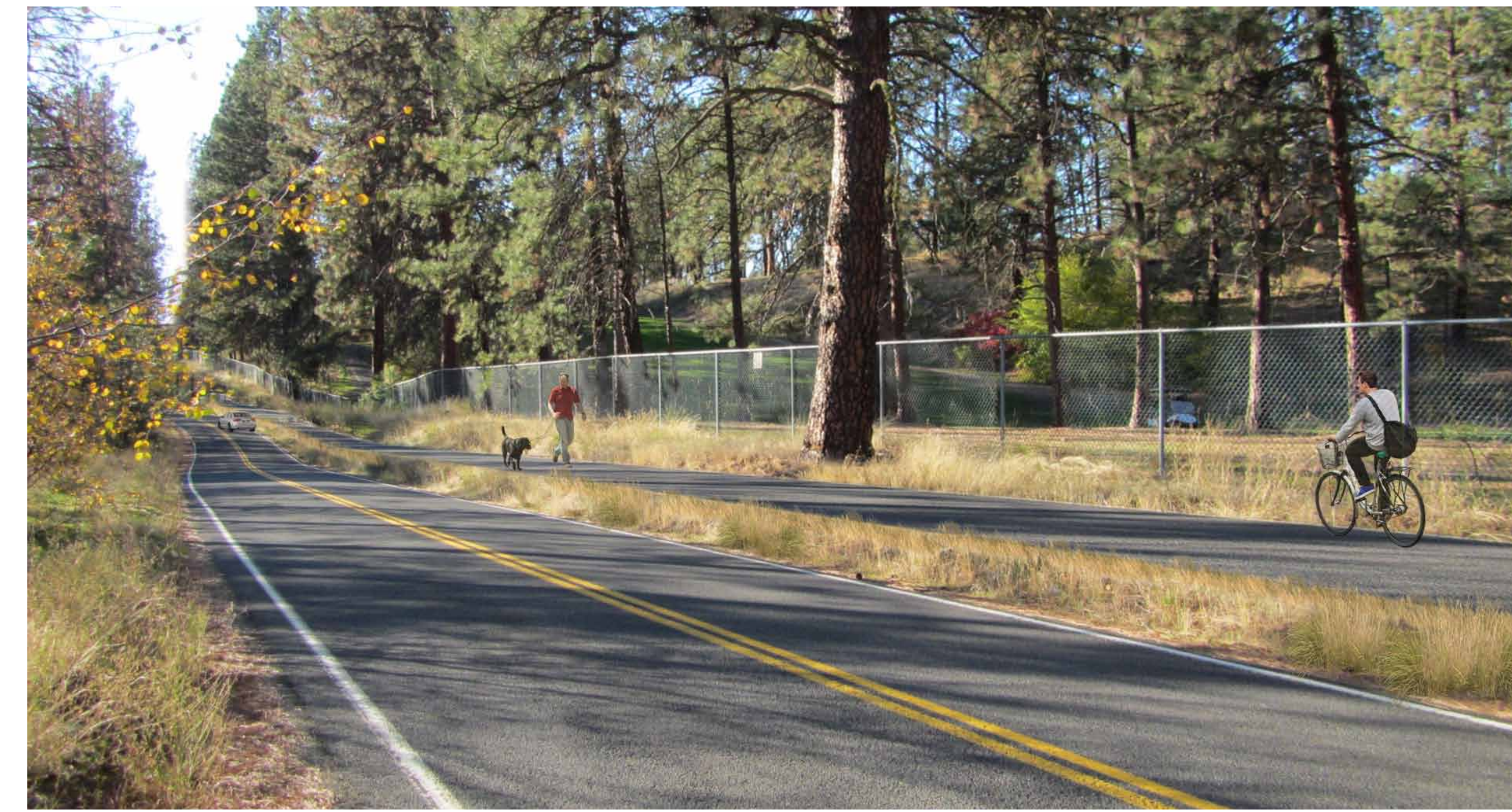
LOOKING NORTHWEST: TRAIL ON THE NORTH SIDE OF DOWNRIVER DRIVE, ADJACENT TO DOWNRIVER GOLF COURSE