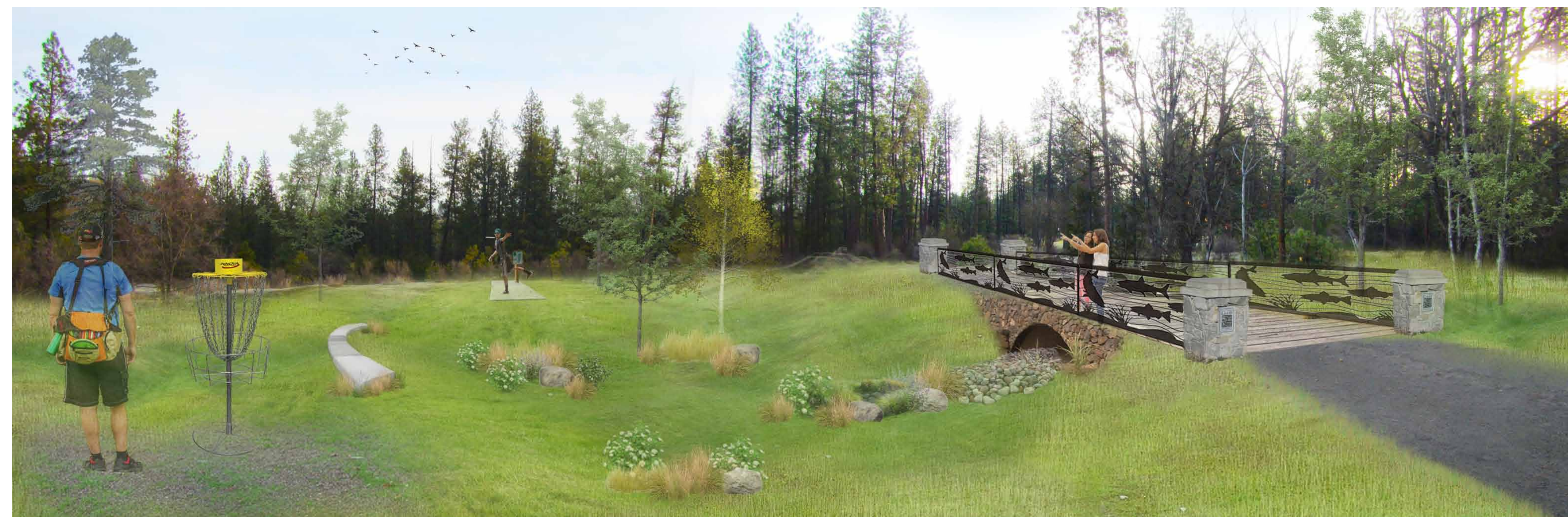
LOOKING EAST: FOOTBRIDGE/OVERLOOK OVER STORMWATER SWALE AND CONCRETE WEIR