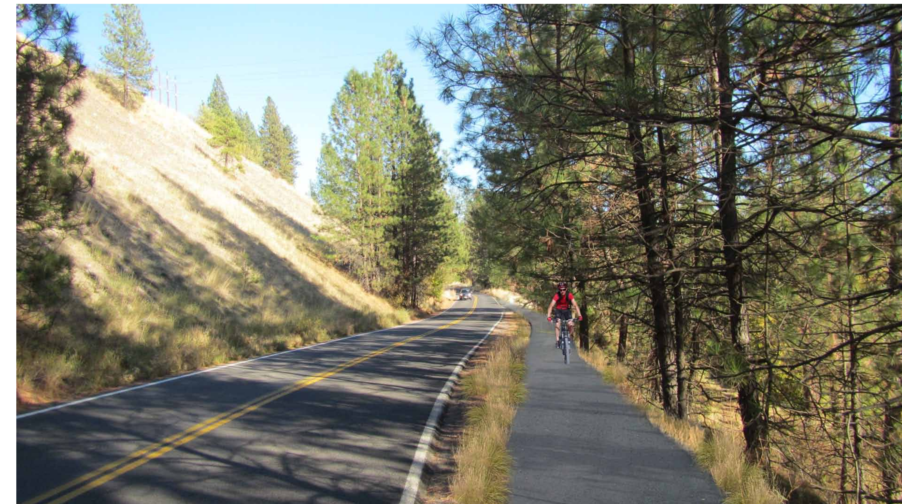
LOOKING EAST: TRAIL ON THE SOUTH SIDE OF DOWNRIVER DRIVE