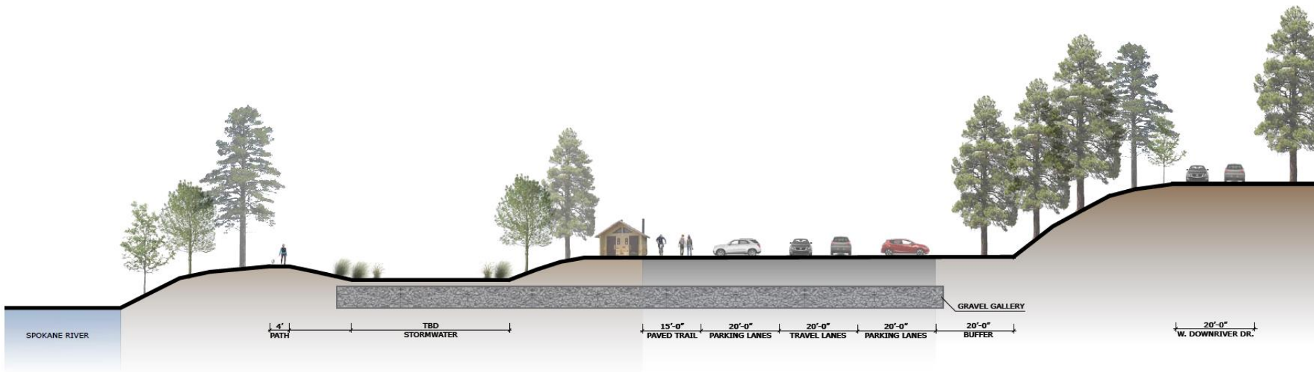
SECTION THROUGH PROPOSED TJ MEENACH PARKING LOT