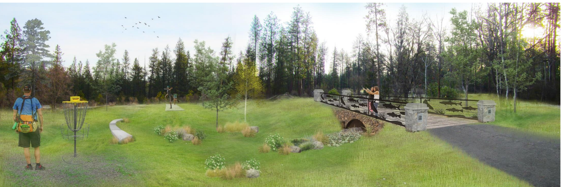
DISC GOLF AREA