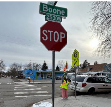
High visibility crosswalks

Initial ideas for projects include a range of treatments for streets in the West Central Neighborhood to address a wide variety of safety issues at the intersection and corridor level.