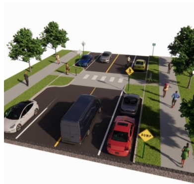
Landscaping in curb extensions