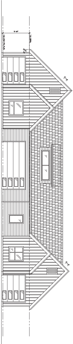
ELEVATION 1/8" = 1'-0"

NOTES: 1. THIS DRAWING IS THE PROPERTY OF RUSSELL C. PAGE ARCHITECTS. NO PART OF THIS DRAWING IS TO BE REPRODUCED OR TRANSMITTED IN ANY FORM OR BY ANY MEANS, ELECTRONIC OR MECHANICAL, INCLUDING PHOTOCOPYING, RECORDING, OR BY ANY INFORMATION STORAGE AND RETRIEVAL SYSTEM, WITHOUT THE WRITTEN PERMISSION OF RUSSELL C. PAGE ARCHITECTS.