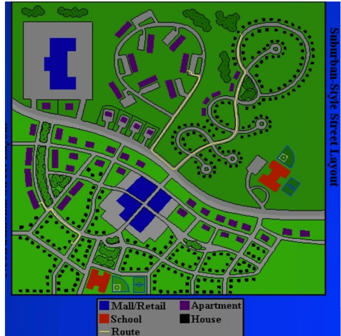
Comparison of city planning in motorized transport and in traditional walkable design.

The illustration to the right in the lower lighter (green) area shows an ideal design that integrates residential, educational, and commercial land uses, making this design more like cities before WW II after which city planning made motorized transport king.