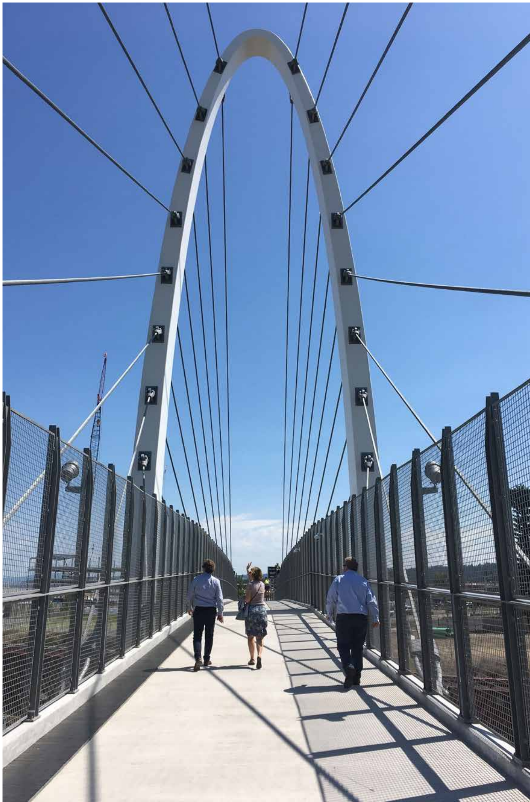
The University Gateway Bridge has created a new walking and cycling link between the north and south halves of the University District.