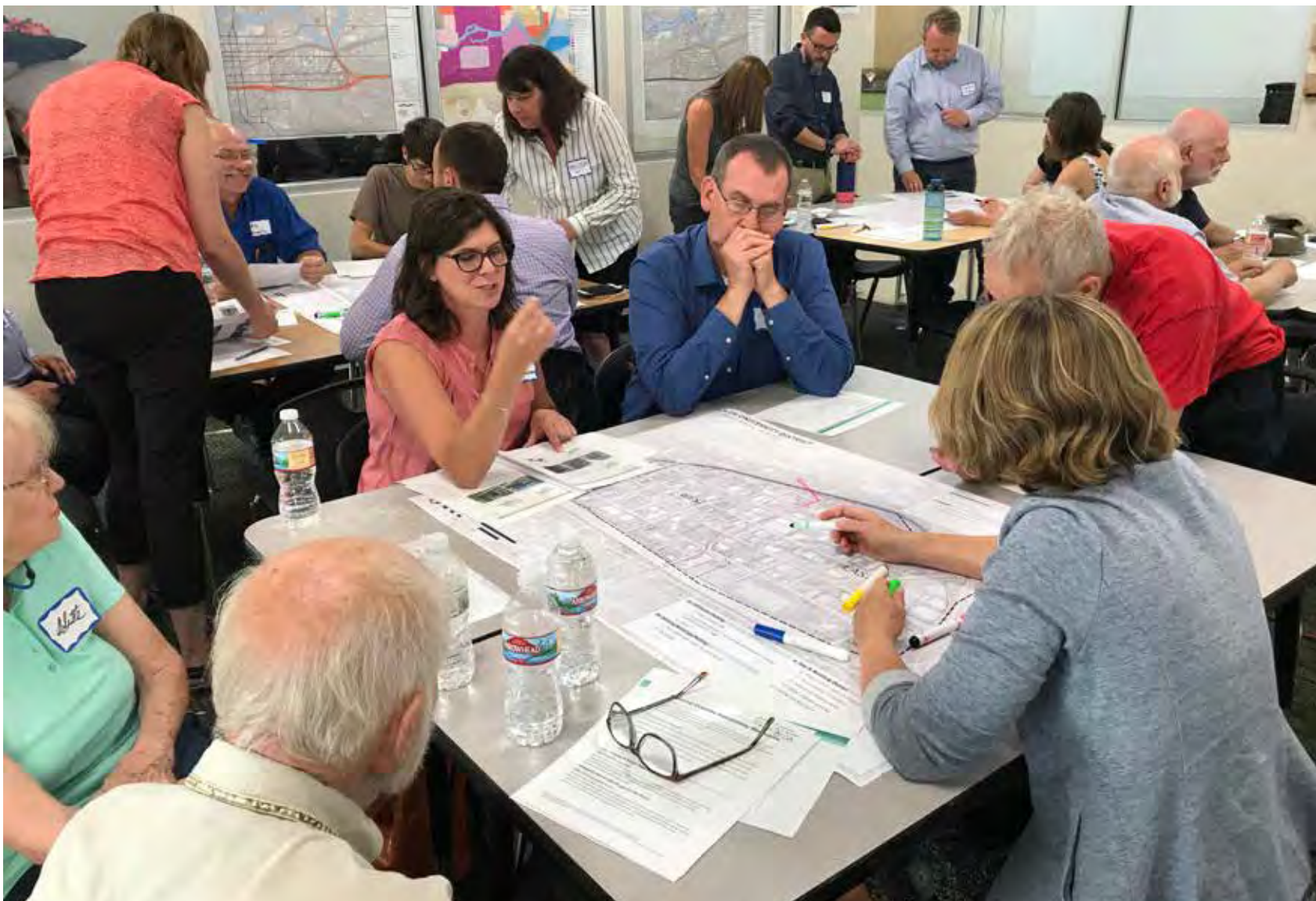
The community design workshop for the South University District Subarea Plan was held on July 30, 2019.