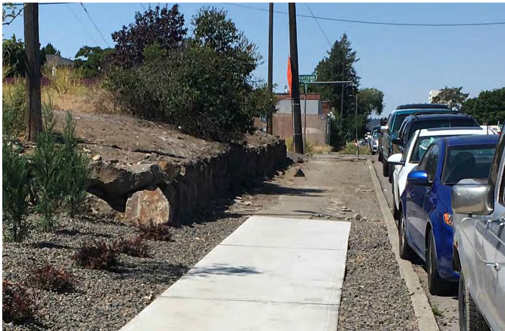
Sporadic property development and past lax standards have resulted in disconnected pedestrian infrastructure.