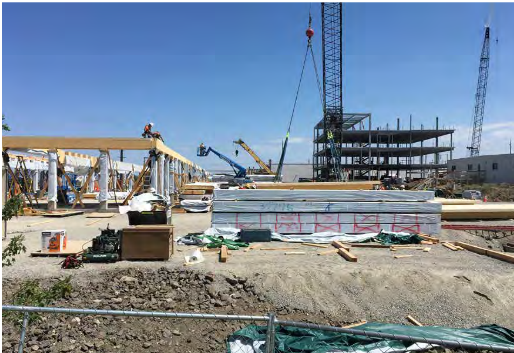
New development at the University Gateway Bridge landing features cross-laminated-timber construction, a cutting-edge technology locally produced in Spokane.