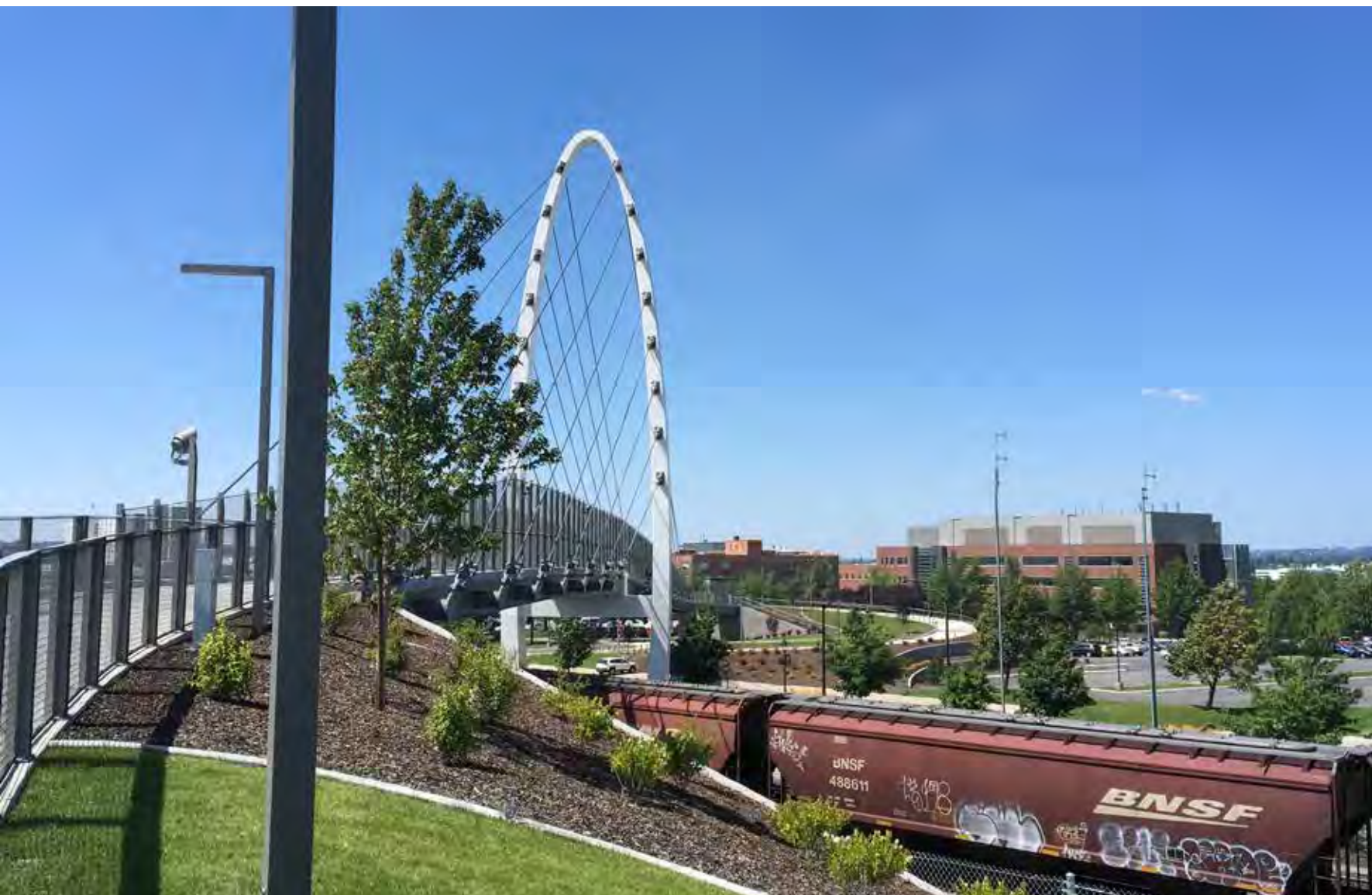
The University Gateway Bridge spans BNSF railroad tracks, a major barrier to movement.