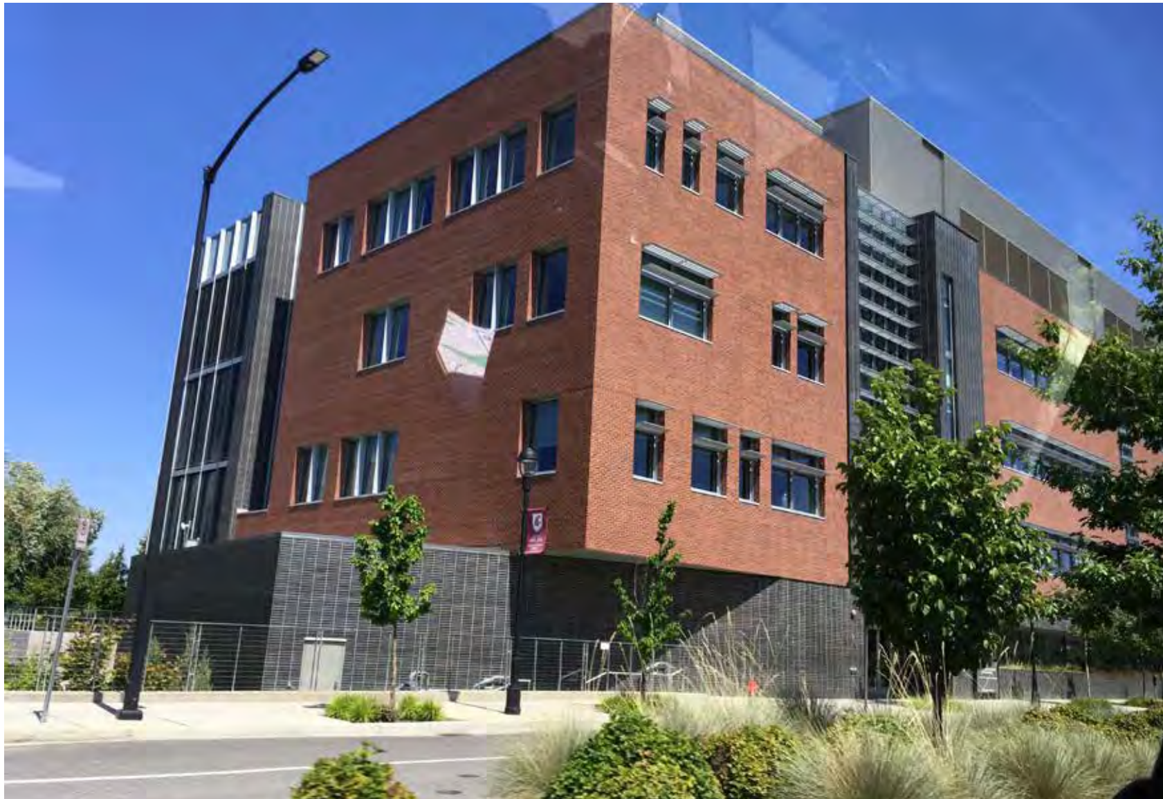
Universities north of the bridge plan to continue to expand their presence in Spokane, including potential new construction in the South University District.