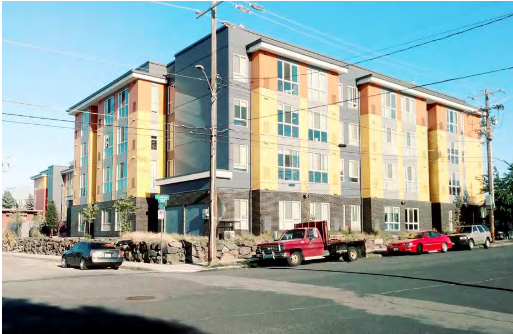
Several new low-barrier affordable housing developments have been constructed in and around the district. These structures play a critical in combating homelessness and providing services, however businesses and property owners have expressed concerns about potential impacts on the neighborhood's desirability for market-rate development.