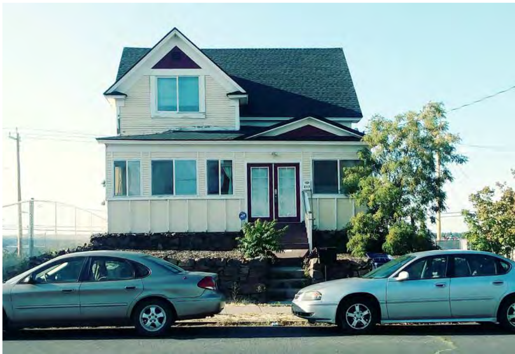
Older residential buildings remain through the district, providing a reminder of the area's history, enriching its character, and adding variety to the built environment.