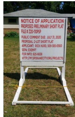
Posted notice sign example. This requirement could be removed for short plats

The changes under consideration include: