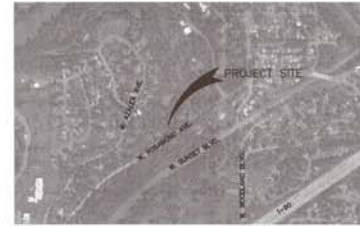
VICINITY MAP N13