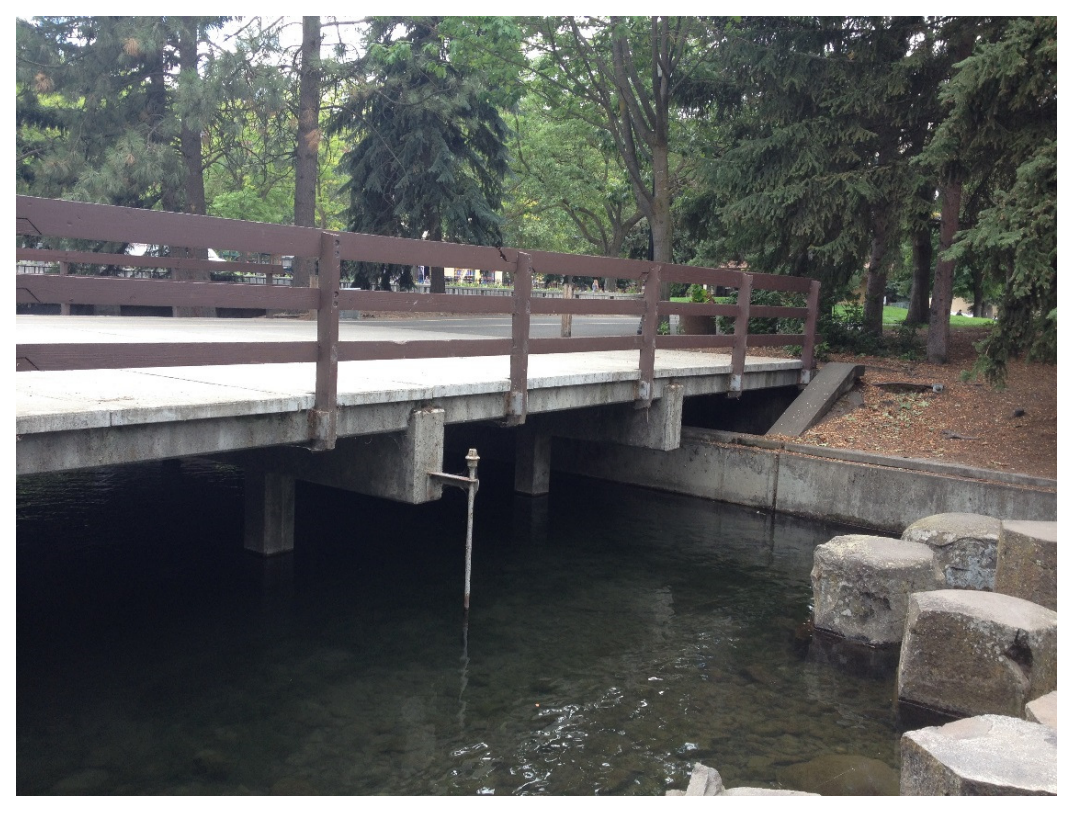
Photo 2 : At northeast corner of the existing Theme Stream Bridge looking to the southwest. Shows a portion of the basalt columns in the Theme Stream water feature.