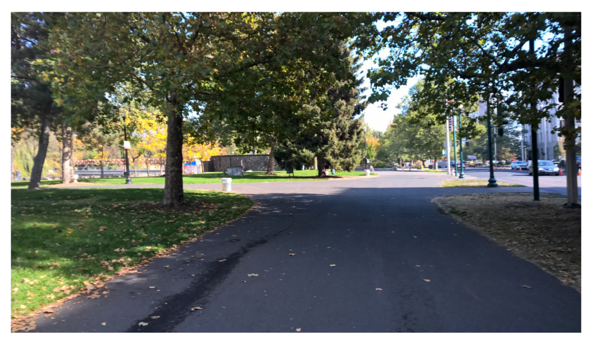
Photo 3: Looking east from the Gondola Meadow and Spokane Falls Boulevard to the Fountain Café.