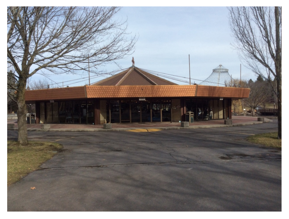
Photo 4: Looff Carousel in Riverfront Park (street level view from Spokane Falls Boulevard).