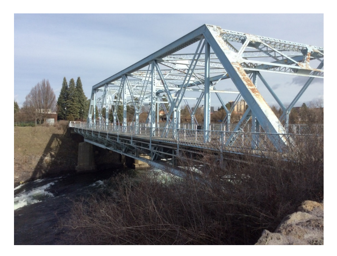
Photo 8: Looking north from Havermale Island at the Howard Street Middle-Channel Bridge with Canada Island in the background.