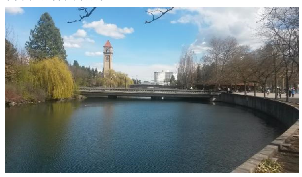
Photo 1: Howard Street South Channel Bridge with Clock Tower in the background.