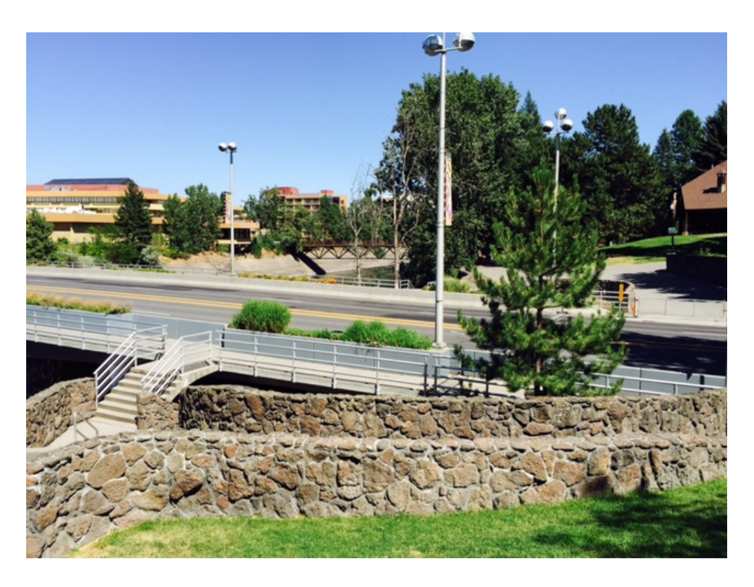
Photo 7: Steps on the south end of the Washington Street Bridge and basalt walls common throughout Riverfront Park.