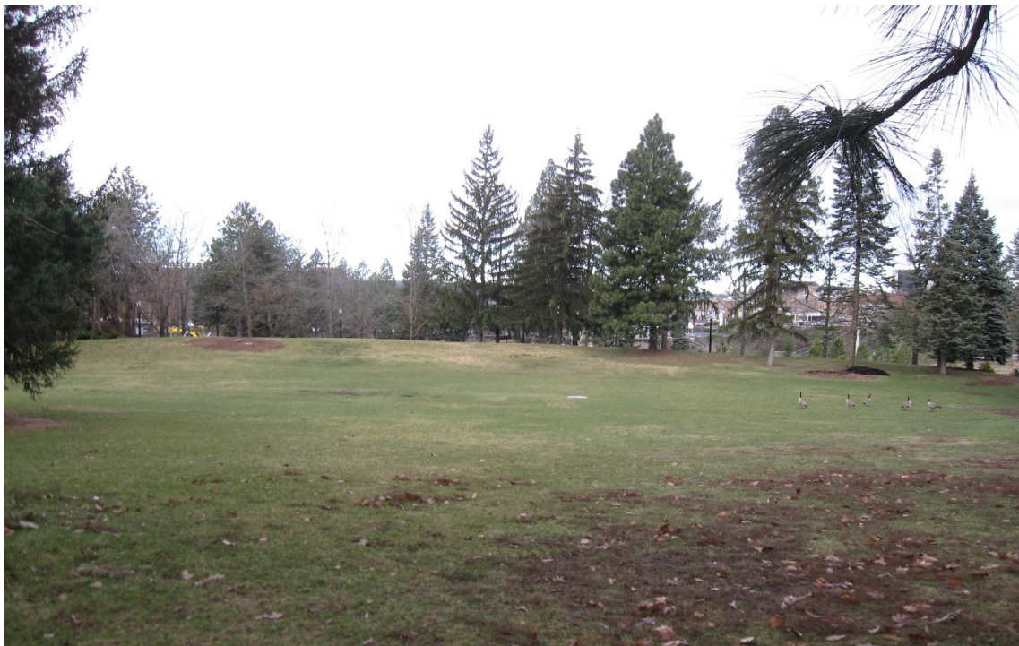
Photo 14: Looking west across the meadow from the below the trees on the east berm.