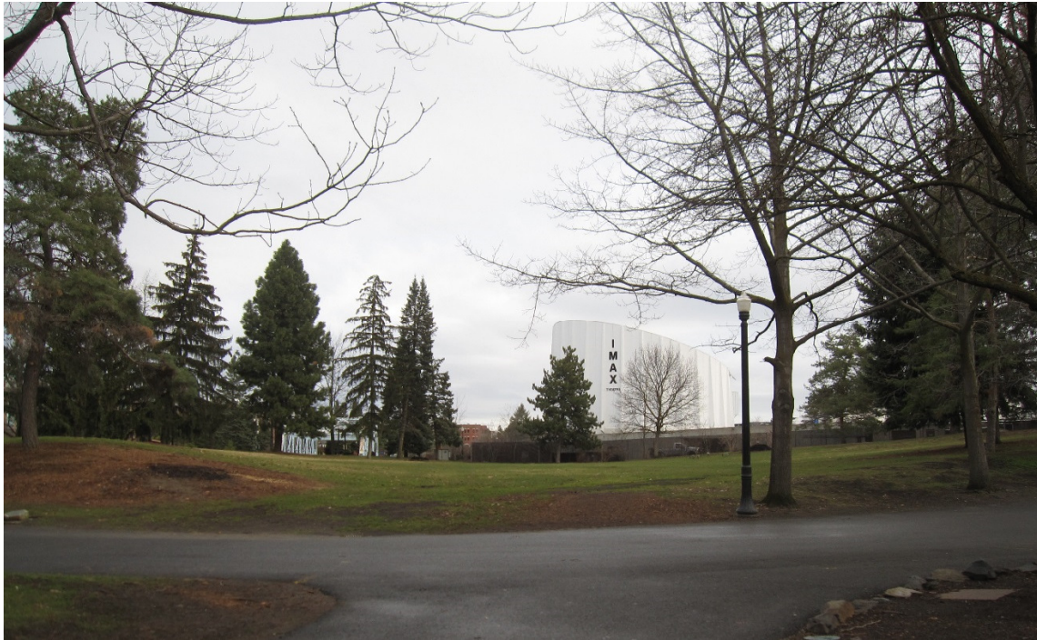
Photo 11: Looking northeast through the meadow from just north of the Howard Street Middle Channel Bridge.