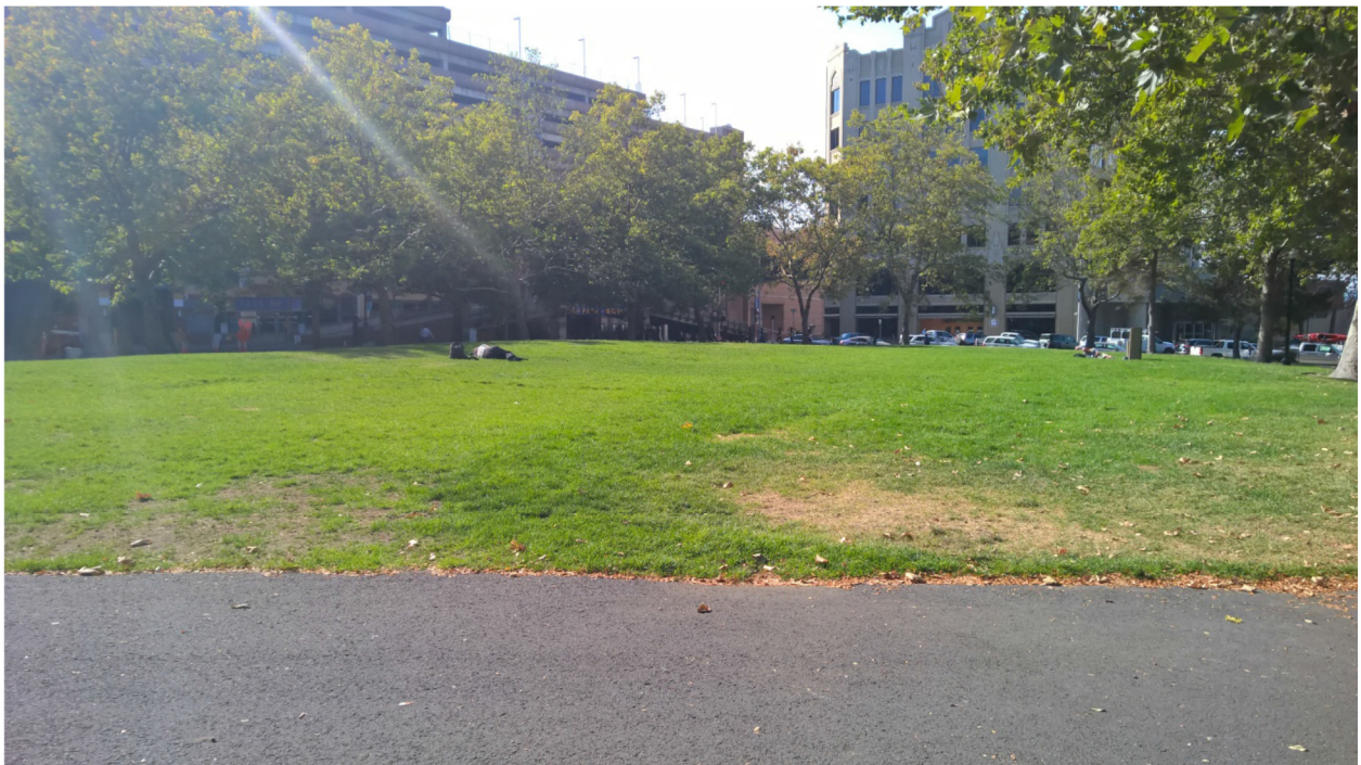
Photo 8: Looking southwest with City Hall on the right and Riverfront Shopping Mall on the left.