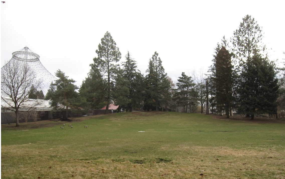
Photo 13: Looking east across the meadow from the below the trees on the west berm.