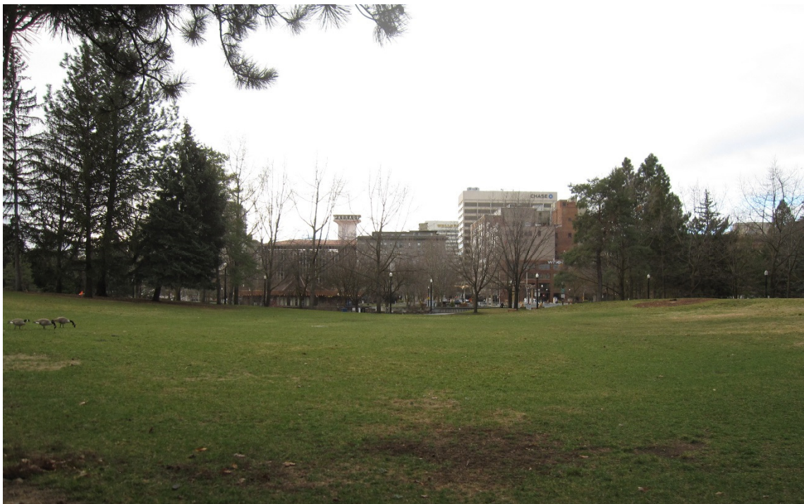
Photo 12: Looking south with the Spokane River and Carousel in the background.