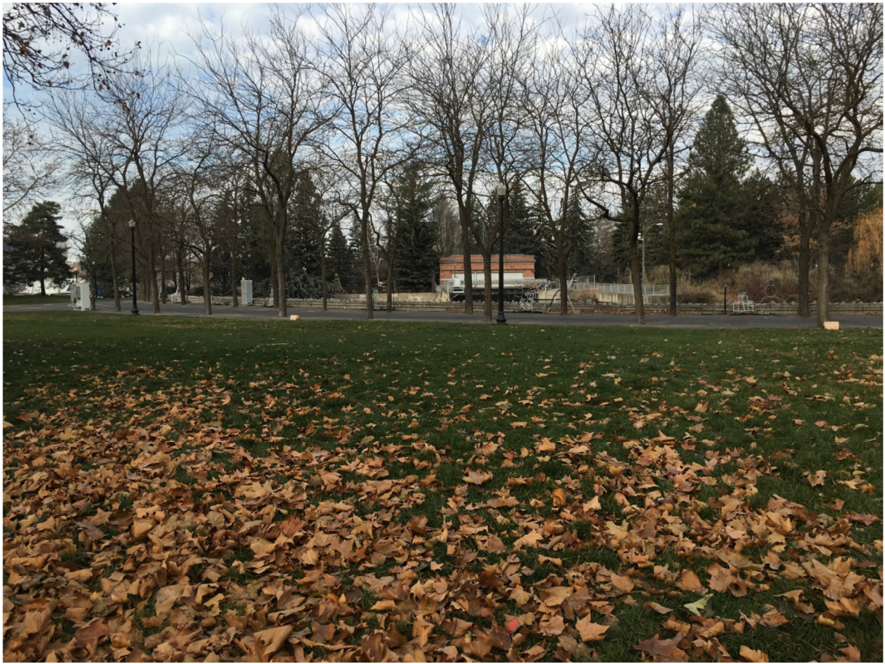
Photo 10: Looking north to the locust tree lane (Spokane River is behind the trees but can't be seen because it is below the concrete river channel).