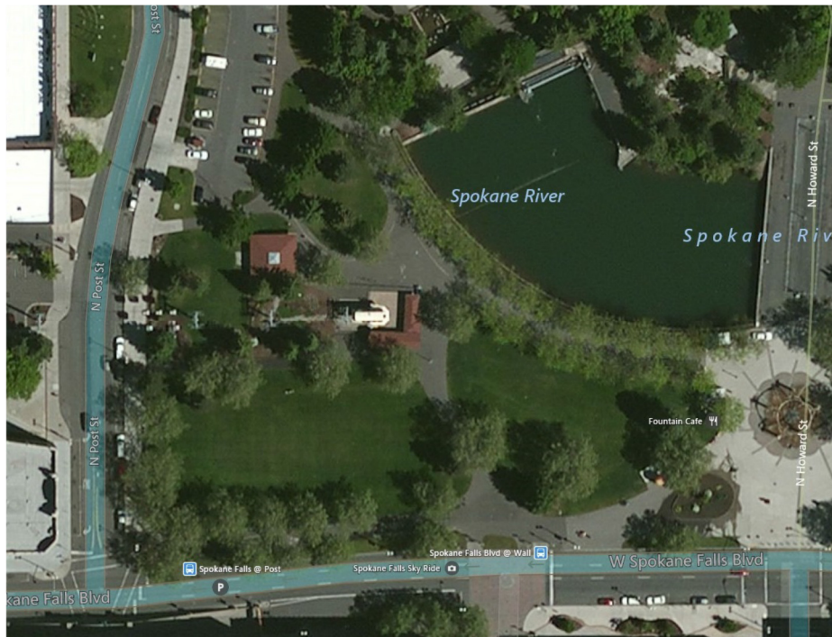
Photo 1: Aerial photo of southwest corner of Riverfront Park. Shows Post Street to the west, a parking lot and the Spokane River to the north, the Fountain Café and Rotary Fountain to the east, and Spokane Falls Boulevard to the south.

The photos presented in this letter came from Stantec's report, Spokane Riverfront Park Ice Ribbon & Skyride Building, City of Spokane Design Review, Step 1, – Program Review (amended December 28, 2015).