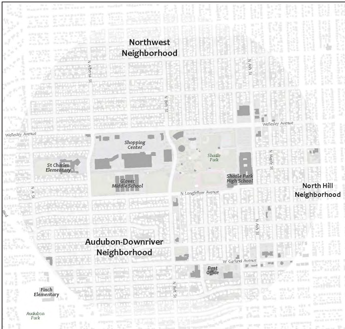
Figure 1: Shadle Area Map