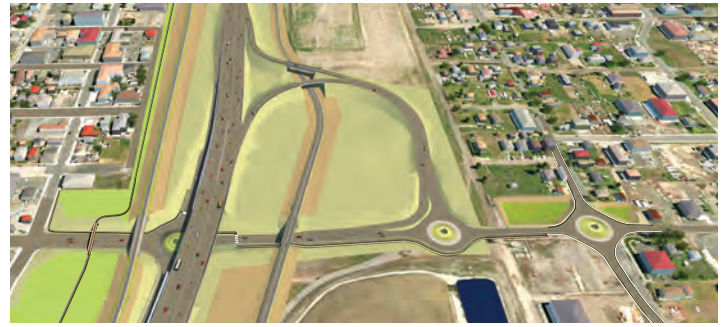
Wellesley Interchange Visualization - Looking North