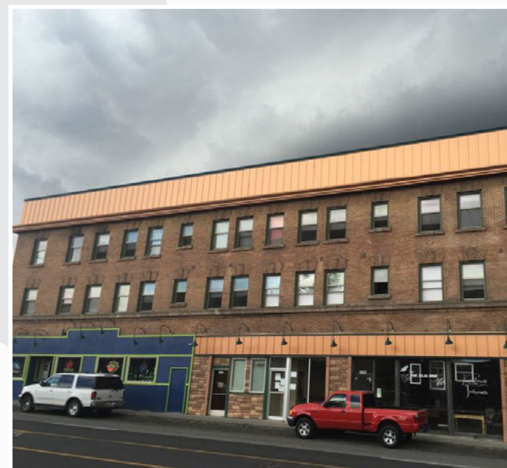
Higher concentration of buildings oriented towards the street