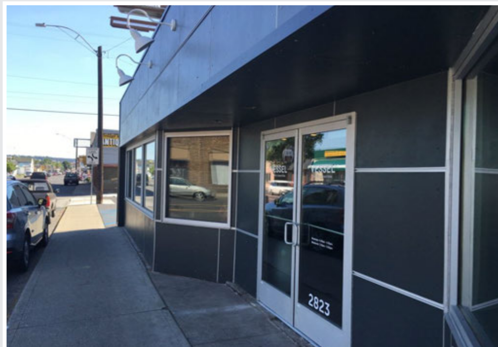
Businesses that cater to neighborhood residents