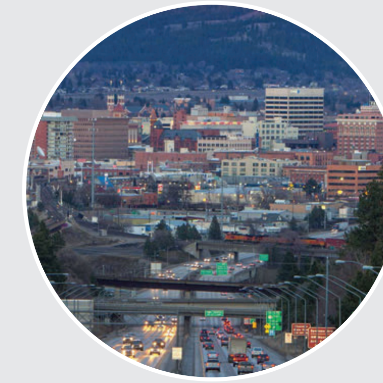
Economic Development Programs