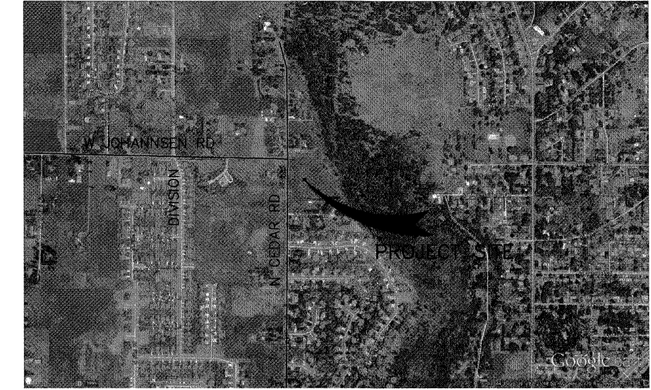
VICINITY MAP NTS

SITUATE IN THE CITY OF SPOKANE, COUNTY OF SPOKANE, STATE OF WASHINGTON.