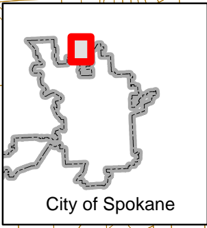
City of Spokane