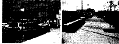
Parking liner walls with plantings contribute to an interesting pedestrian environment. The parking liner wall and screen pictured above is enhanced by larger wall sections near automobile crossing points and a change in sidewalk scoring pattern. Both give cues to pedestrians and drivers.

feet, measured from the property line, must be provided, landscaped and maintained on the exterior of the required wall. Such walls, fences, and landscaping shall not interfere with the clear view triangle. Pedestrian access through the perimeter wall shall be spaced to provide convenient access between the parking lot and the sidewalk. There shall be a pedestrian access break in the perimeter wall at least every one hundred fifty feet and a minimum of one for every street frontage. Any paving or repaving of a parking lot over one thousand square feet triggers these requirements.