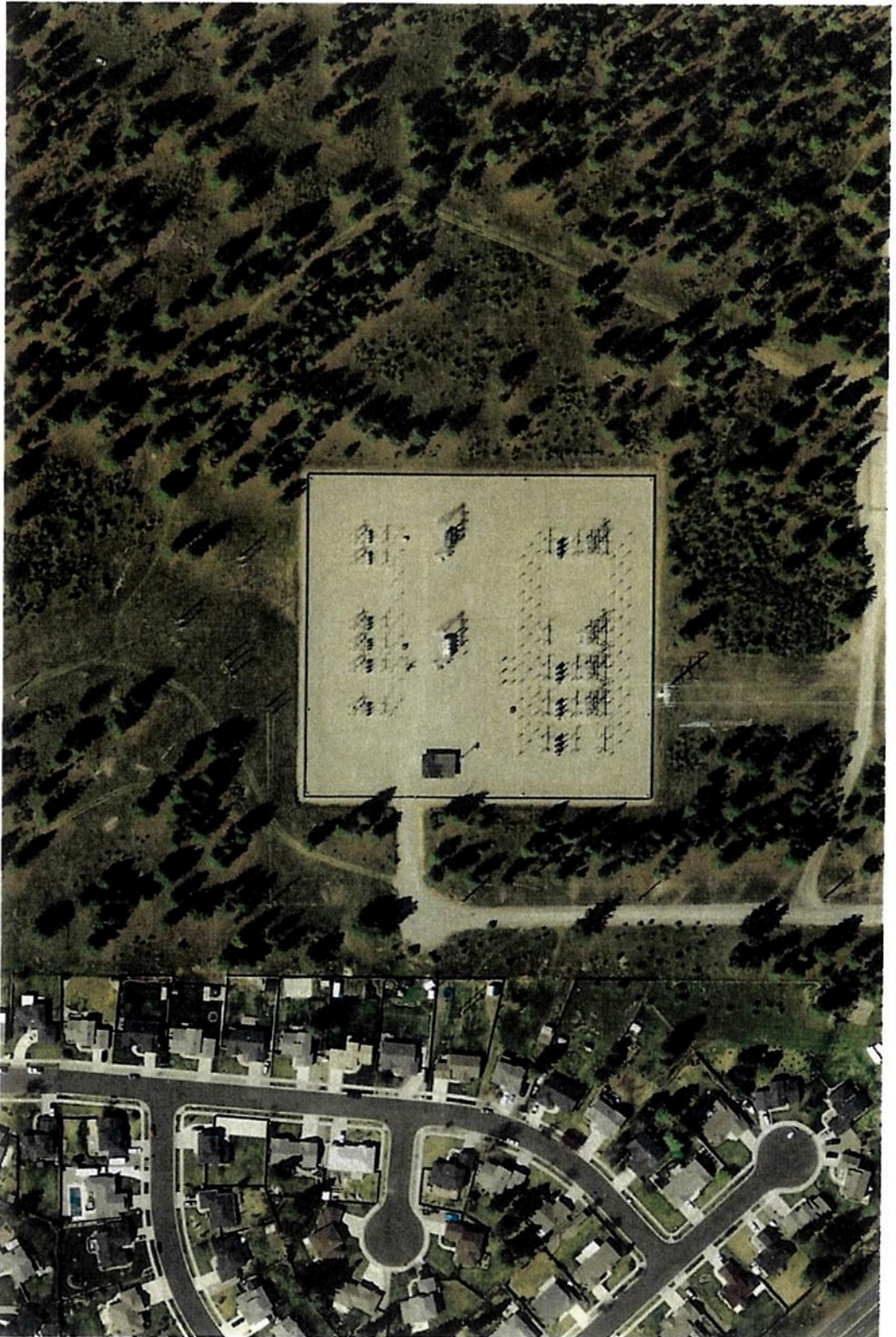
Figure 3: Existing Substation Footprint