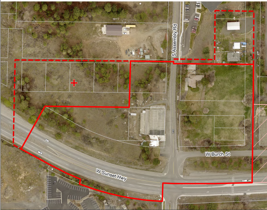
Detailed Aerial Photo (2022)

THIS IS NOT A LEGAL DOCUMENT The information shown on this map is compiled from various sources and is subject to constant revision. Information shown on this map should not be used to determine the location of facilities in relationship to property lines, section lines, streets, etc.