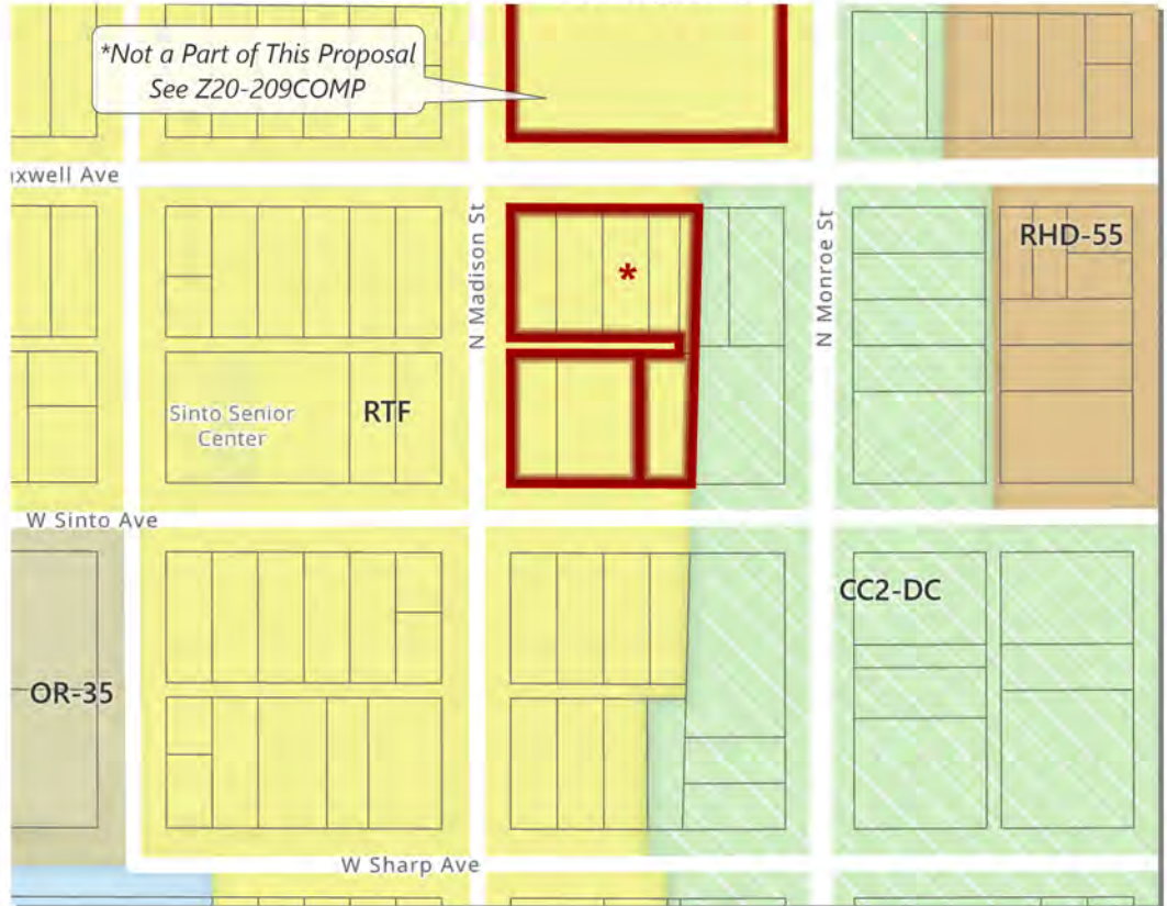
EXHIBIT D: Proposed Zoning

* City Council has expanded the application to include these additional six properties. These properties are to be considered concurrently as a city-sponsored proposal.