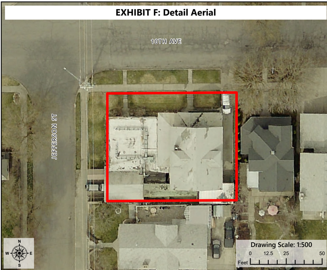
EXHIBIT F: Detail Aerial

The information shown on this map is compiled from various sources and is subject to constant revision. Information shown on this map should not be used to determine the location of facilities in relationship to property lines, section lines, streets, etc.