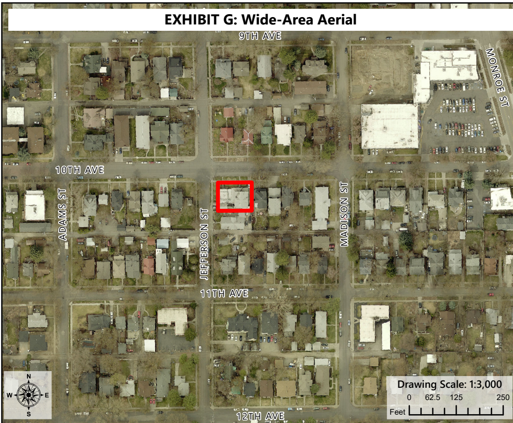
EXHIBIT G: Wide-Area Aerial