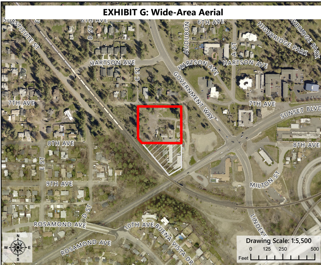
EXHIBIT G: Wide-Area Aerial