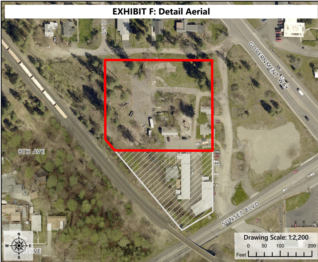
EXHIBIT F: Detail Aerial

The information shown on this map is compiled from various sources and is subject to constant revision. Information shown on this map should not be used to determine the location of facilities in relationship to property lines, section lines, streets, etc.