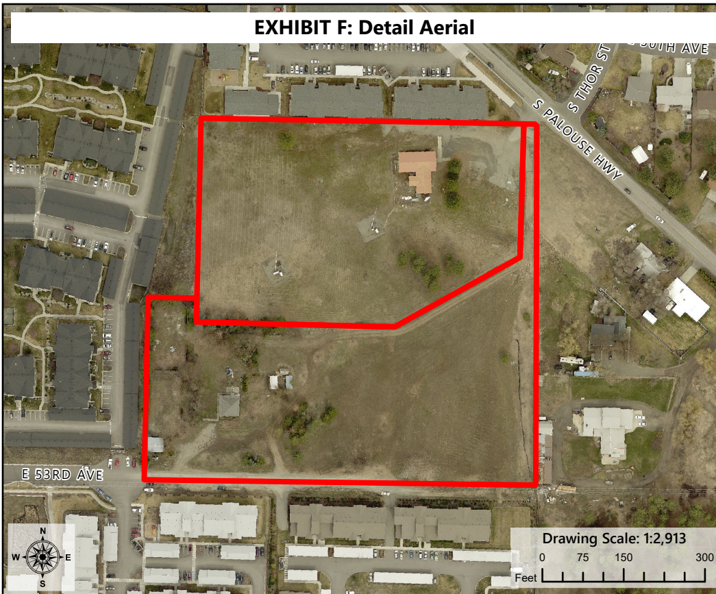
EXHIBIT F: Detail Aerial

The information shown on this map is compiled from various sources and is subject to constant revision. Information shown on this map should not be used to determine the location of facilities in relationship to property lines, section lines, streets, etc.