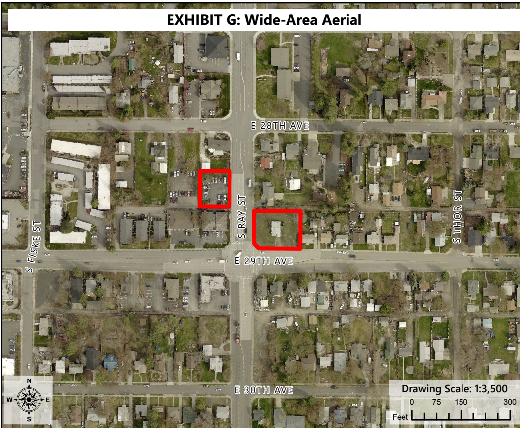
EXHIBIT G: Wide-Area Aerial