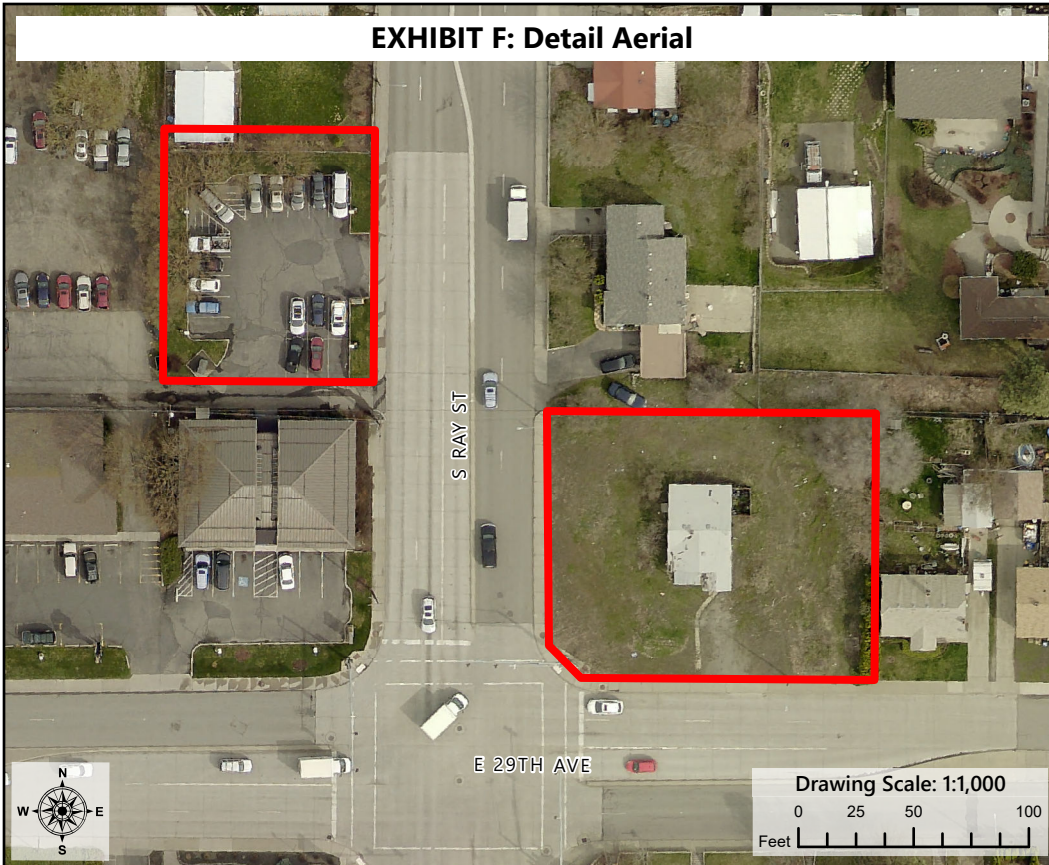
EXHIBIT F: Detail Aerial

The information shown on this map is compiled from various sources and is subject to constant revision. Information shown on this map should not be used to determine the location of facilities in relationship to property lines, section lines, streets, etc.