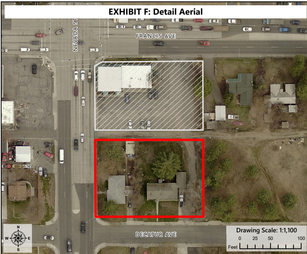
EXHIBIT F: Detail Aerial

The information shown on this map is compiled from various sources and is subject to constant revision. Information shown on this map should not be used to determine the location of facilities in relationship to property lines, section lines, streets, etc.