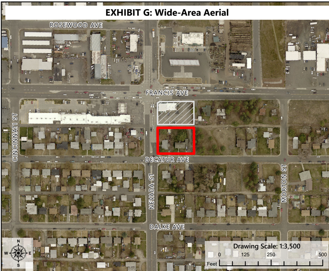
EXHIBIT G: Wide-Area Aerial

Acres (Proposal): 0.51 Acres (Adjacent): 0.45