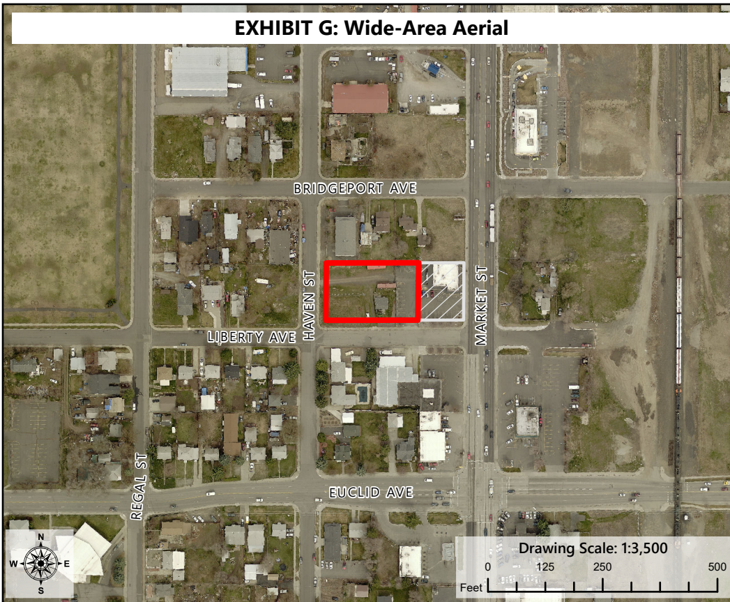
EXHIBIT G: Wide-Area Aerial

Acres (Proposal): 0.85 Acres (Adjacent): 0.28