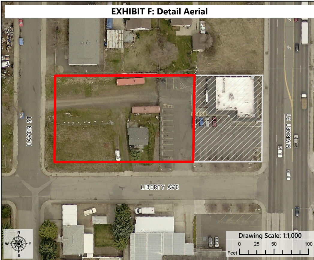
EXHIBIT F: Detail Aerial

The information shown on this map is compiled from various sources and is subject to constant revision. Information shown on this map should not be used to determine the location of facilities in relationship to property lines, section lines, streets, etc.