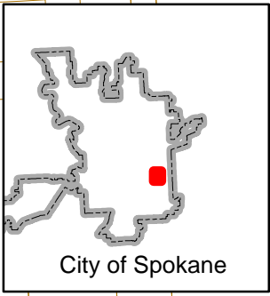
City of Spokane