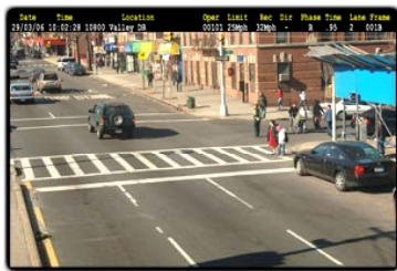
Second Image - Shot of Vehicle in Intersection