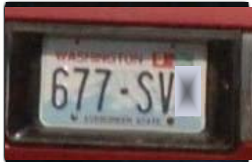
License Plate Close-up from one of the two violation images