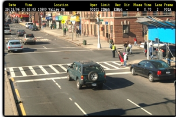
First Image - Before Shot of Violation