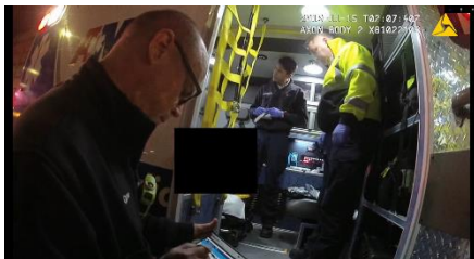
Targeted Video Redaction