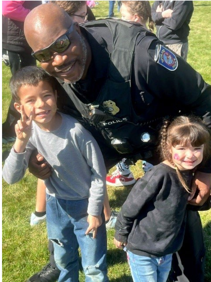
A Reserve Officer stands with two children at an Easter Egg Hunt

Spokane Police Department Volunteers are shown here going to an Easter Egg hunt at the Northeast Community Center.