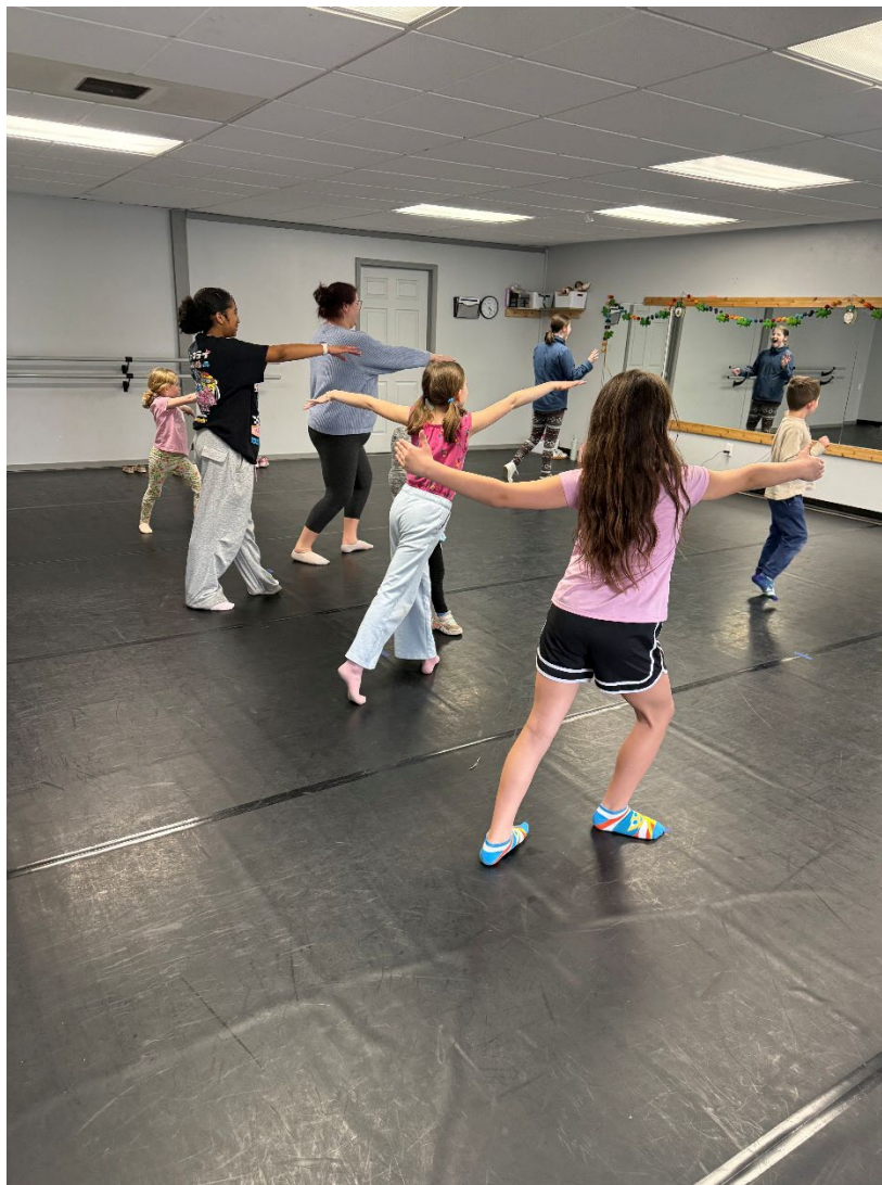
Children in the DEA Educational Foundation Dance Program

Below, children in the program learn a new dance.