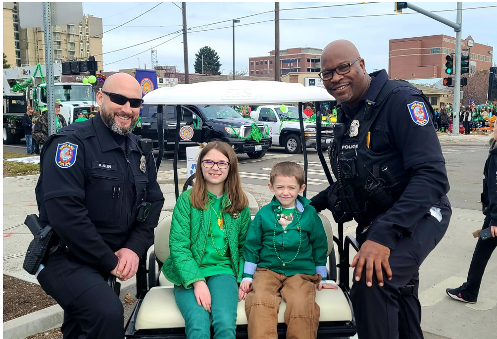
Two volunteer Reserve Officers pose with children at the St. Patrick's Day Parade.

SPD Volunteers range in age from 14 to 85 and have a variety of backgrounds, from students, business owners, former military, pilots and former FBI agents. With these diverse backgrounds, they all share one thing in common - a desire to help our department and serve the citizens of Spokane. The volunteers are responsible for a range of responsibilities from working the information booth and front desks at the Public Safety Building and the Gardner Building, supporting the Police Activities League program, working community events such as Bloomsday and Lilac Parade, and assisting officers on patrol. SPD also has many volunteer chaplains.