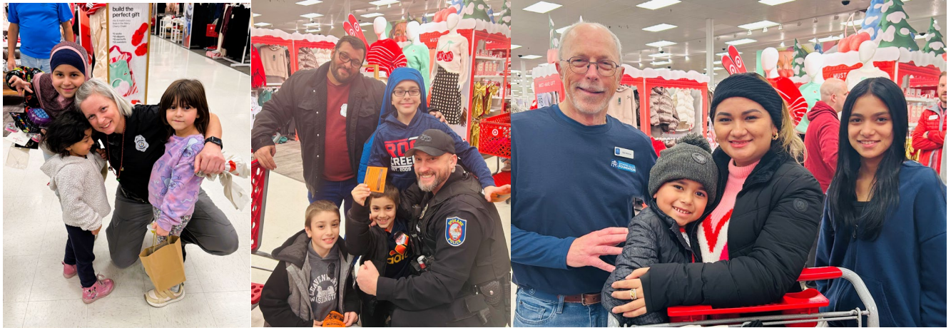
Pictures from the Salvation Army Shop with a Cop event with Airway Heights Police Department.