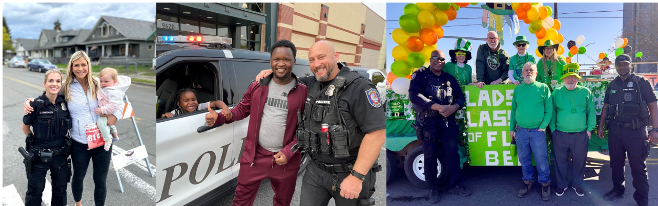
“Serving our community with Integrity, Professionalism, and Compassion”

Volunteers are critical to SPD operations and community engagement. In 2023, SPD focused on growing the Volunteer Services Program, ending the year with 99 volunteers (double the amount from 2021). These volunteers contributed 27,742 hours to the department and community. In 2024, SPD will continue to recruit volunteers for all programs. Below, volunteers at Bloomsday, Shop with a Cop, and St. Patrick’s Day Parade.