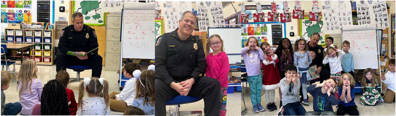
Below, officers talking to students at the Spokane School District 5 th Grade Career Fair.