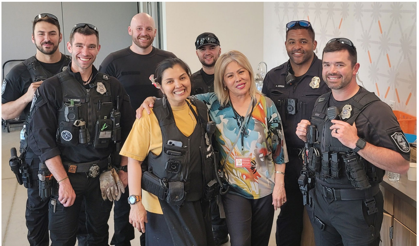
SPD Officers at Asian American, Native Hawaiian, and Pacific Islander (ANHPI) Heritage Days.