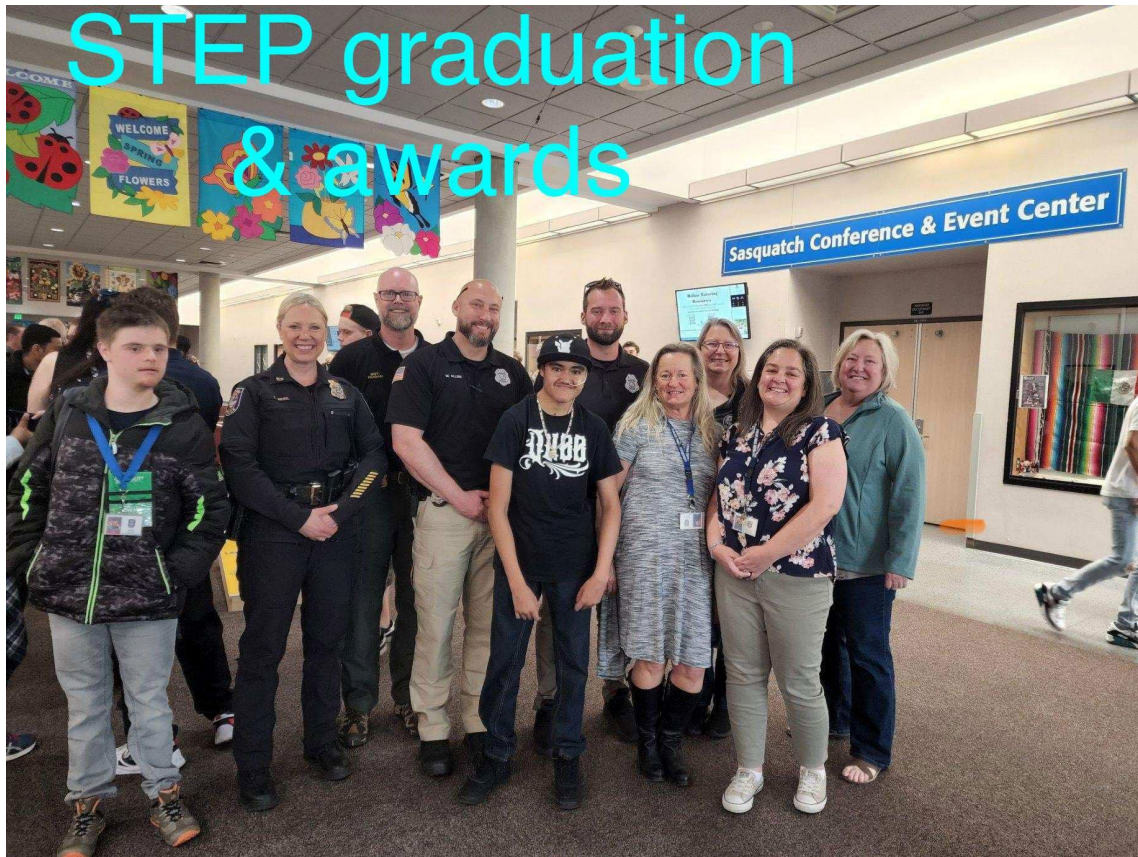
Several SPD employees and volunteers attended STEP graduation.