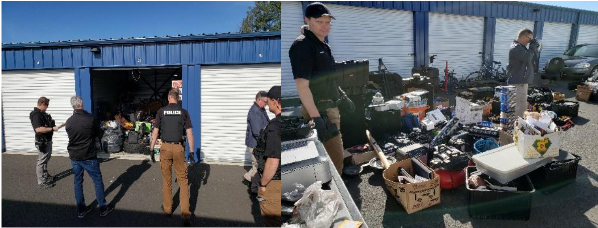
Above, South NROs dealing with stolen property

The transition of the Jewels Helping Hands Warming Center led to a large group of people pitching tents in Coeur d'Alene Park in an act of protest. South Precinct responded, with the help of Spokane Transit Authority, to transport the campers to the library shelter space. A small portion of the illegal campers took down their tents without incident, but many others stayed and began chanting that they would not leave. Available Patrol Officers were called in to assist, due to the likelihood of arrests. Protesters were told they still had the opportunity to spend one more night at the Cannon Shelter, so they eventually left peacefully. Many accolades came to SPD through different community members on how peacefully it was handled.