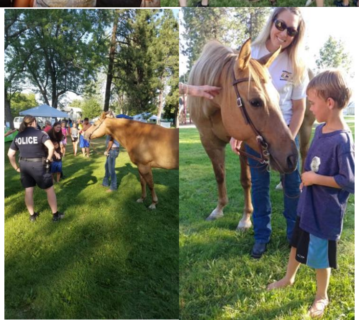
National Night Out Against Crime