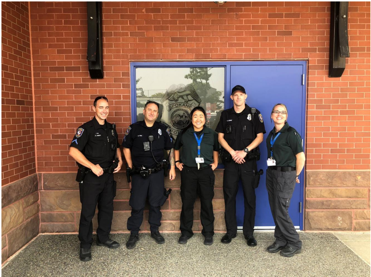
Below: SPD Officers and FBH Clinicians

For more details, please see the article in the Frontier Behavioral Health newsletter in the “Noteworthy News” section at the end of this report.