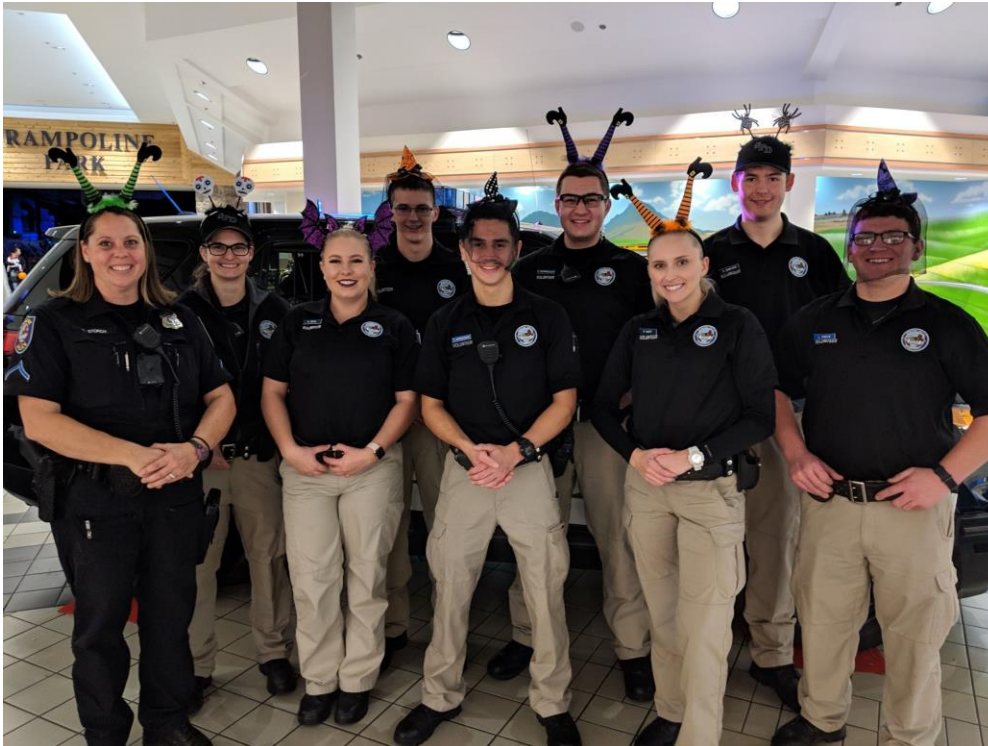
Above: SPD Volunteers on Halloween