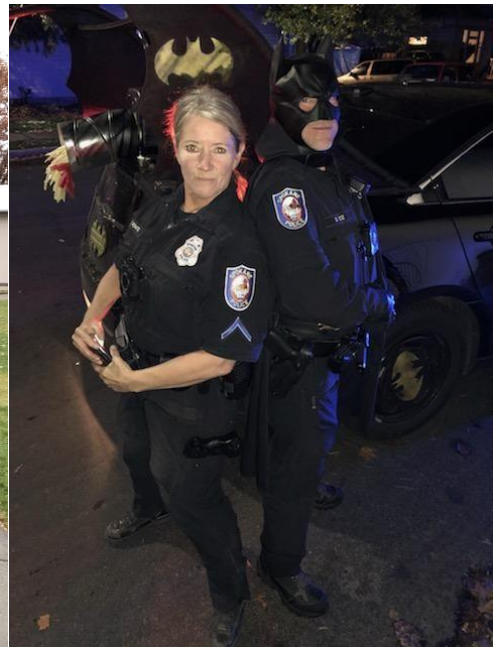
Above: Batman visiting schools, NRO Ponto with NRO Hice as Batman