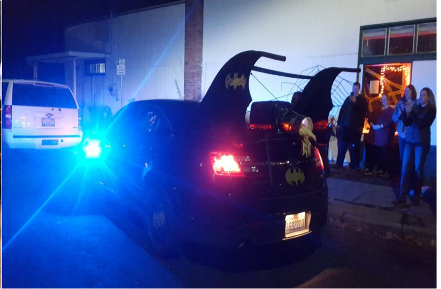
Above: Pictures at the Halloween party, and the Batmobile