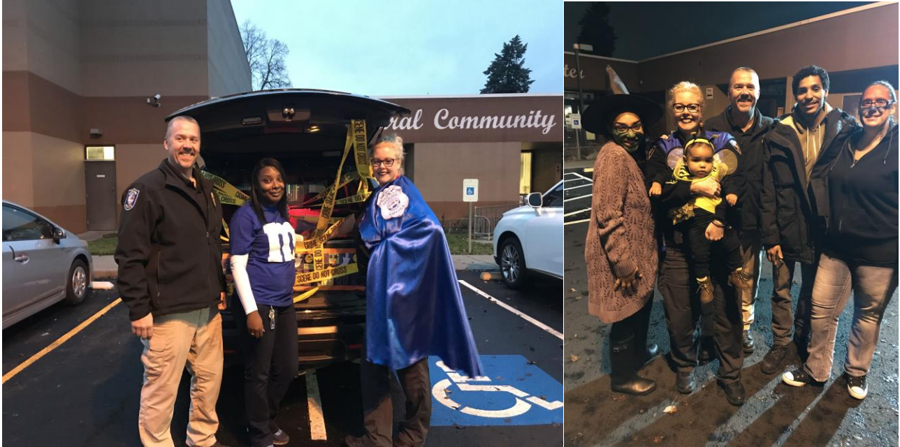
Above: SPD at Trunk or Treat Event, MLK Center at East Central Community Center