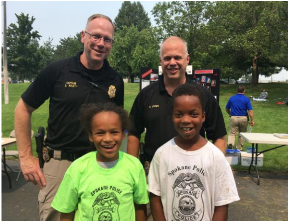
Photos from the PAL BBQ