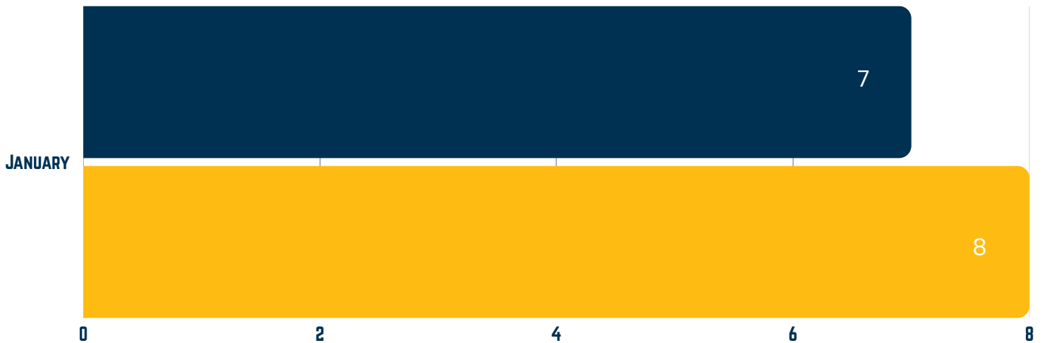
Monthly comparison of OPO complaints