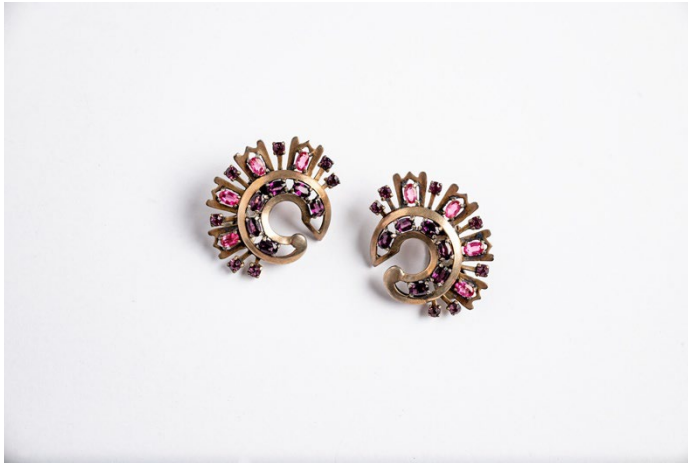
Two costume earrings: semi-circle in metal inset with purple gem/faux gems with metal accents tipped with pink and light purple gems