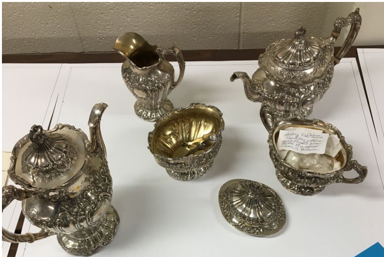
American sterling silver five-piece tea and coffee service in Louis XV style, Gorham Manufacturing Co., Providence, Rhode Island, 1947, in Chantilly-Grand pattern. Of sterling purity (.925 silver), each cast to underside with the manufacturer's name GORHAM over the manufacturer's logo of tripartite type (an anchor flanked by a passant lion facing right and a gothic G, each enclosed in its own octagonal reserve) over the word STERLING over the mold/model number (596 through 600) over the date code of 7 within a square, comprising five pieces ( six including the separate sugar cover ). Weighs a total of 87.65 troy ounces including: a. coffee pot measuring 10.5" tall X 9" long x 4" wide and weighing 27.4oz; b. tea pot measuring 7.5" tall x 10.5" long x 5.25" wide weighing 24.05oz; c. cream pitcher measuring 6.5" tall x 5" long x 3.5" wide weighing 11.4oz; d. twin-handled sugar bowl and cover measuring 6" tall x 7.75" long x 4.5" wide weighing 15.7oz and e. waste bowl measuring 3.25" tall x 5.625" long x 4.5 wide weighing 9.1oz. In rococo-style treatment reminiscent of French examples of the mid-18 th century with a pyriform body cast in bold relief to simulate repousse-type reverse-hammered chasing in a dense pattern of C-scroll cartouches and tattered leafage and radial gadrooning of spoon-back outlines terminating in an openwork scroll-form knob and raised on a spreading round foot. Together with a small pair of American sterling silver tongs , Alvin Manufacturing Co., measuring 4.5" long x .5" wide and weighing .8oz in Orange Blossom pattern. In satisfactory condition and of highly representative casting quality and complexity for the period of manufacture.