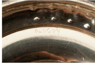
19138 Woldson Artifacts D3B silver tea 04 sugar