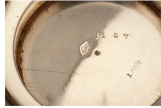
19138 Woldson Artifacts D3C silver tea 02 short teapot