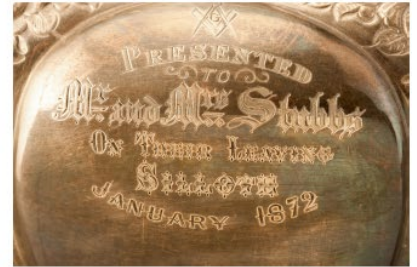
19138 Woldson Artifacts D3E silver tea 02 lg teapot