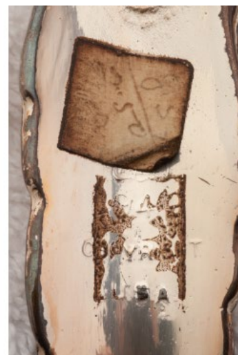
19138 Woldson Artifacts D11_D13 salt and pepper 04