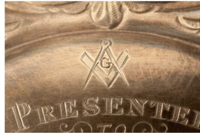
19138 Woldson Artifacts D3E silver tea 01 lg teapot