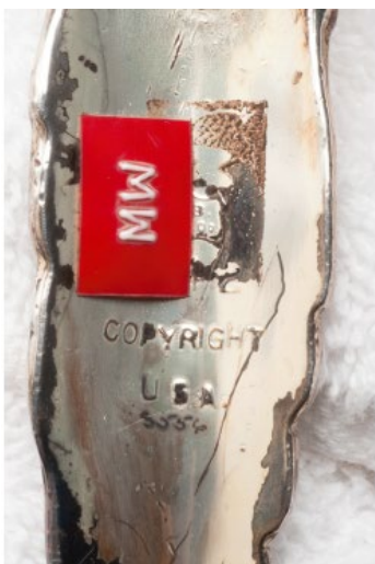
9138 Woldson Artifacts D11_D13 salt and pepper 01