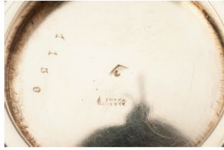
19138 Woldson Artifacts D3B silver tea 03 sugar