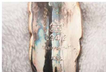
19138 Woldson Artifacts D11_D13 salt and pepper 03