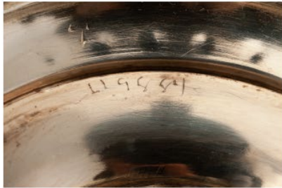
19138 Woldson Artifacts D3D silver tea 07 tall teapot