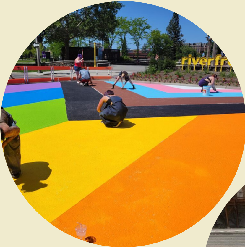
Riverfront Park, Pride Flag Crosswalk