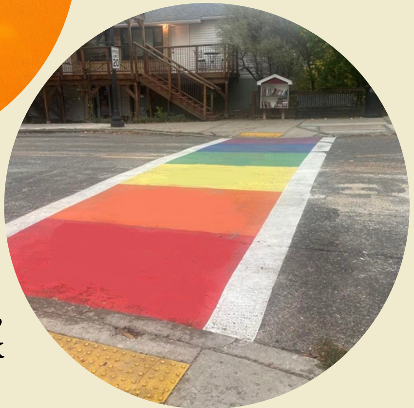
South Perry District, Pride Crosswalk