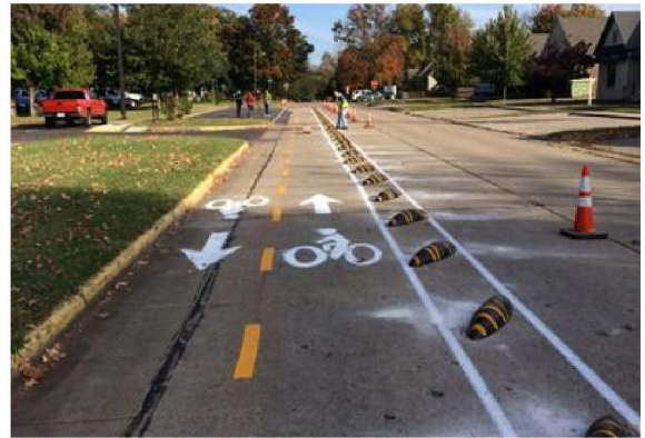
Armadillo Lane Segregators Credit: Tactical Urbanism Materials and Design Guide