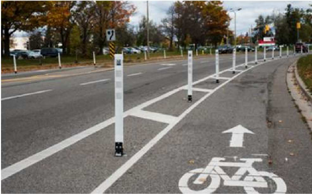
Frequent Flex Posts – City of Toronto, ON Source: Layout - Bicycle lane - bike lane - cycle track - multi-use path flexible bollard - delineator – post