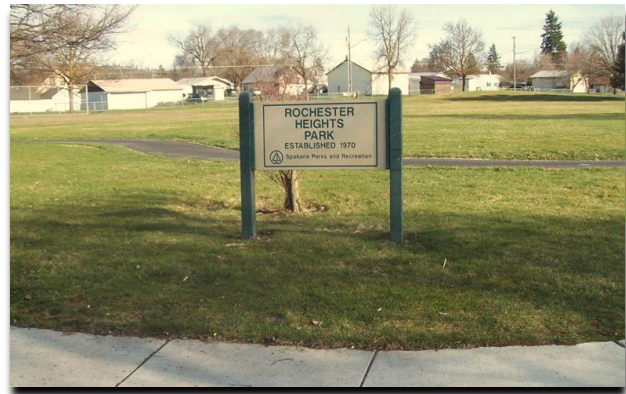
Both photos are of Rochester Park, highlighting the entrance and playground equipment