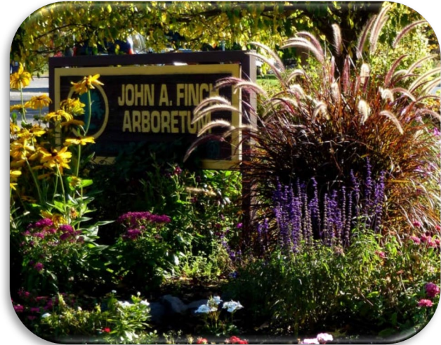
A photo of the gardens at John A. Finch Arboretum in the West Hills neighborhood.