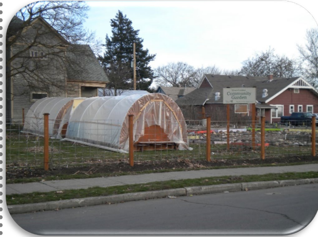
A photo of the community gardens in West Central.