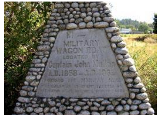
Top Photo: red barn structure in the middle of a field Bottom Photo: military wagon road stone marker